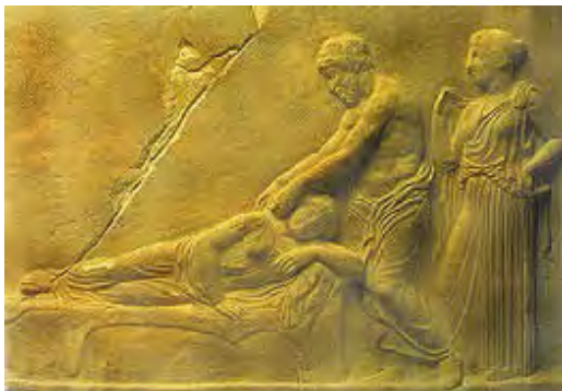
A Dream Temple in Epidauros, 4th Century BCE, known as the cult of Aesclepius, the god of healing.

guidance for a health problem, a life decision, or for more courage in leadership.